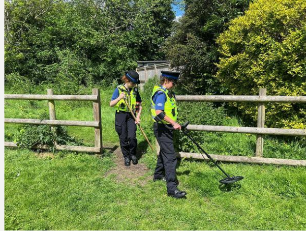
Sceptre- preventative, knife surrender, weapons checks, school talks, test purchases