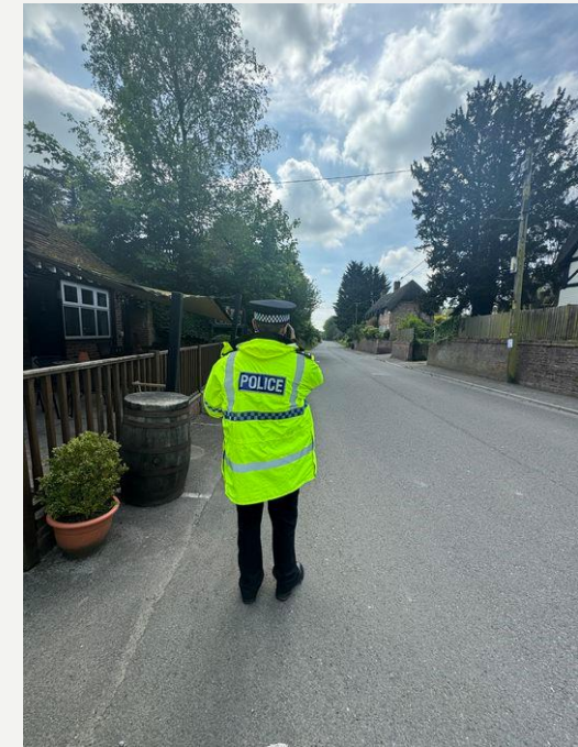
Speed enforcement across the area