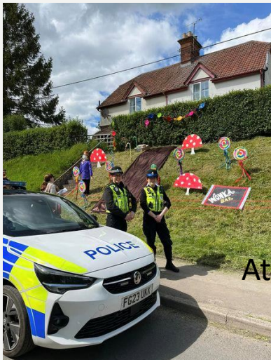
Attending local events