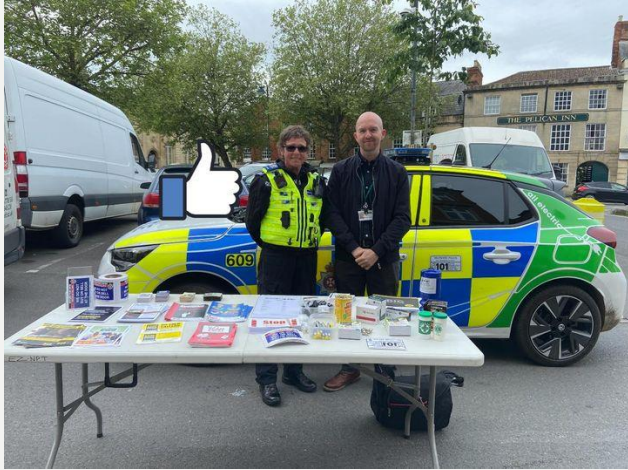
Visibility with partners/trading standards- crime prevention advice