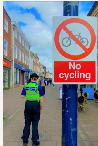
Local issues- Cycling on pavement, PSPO