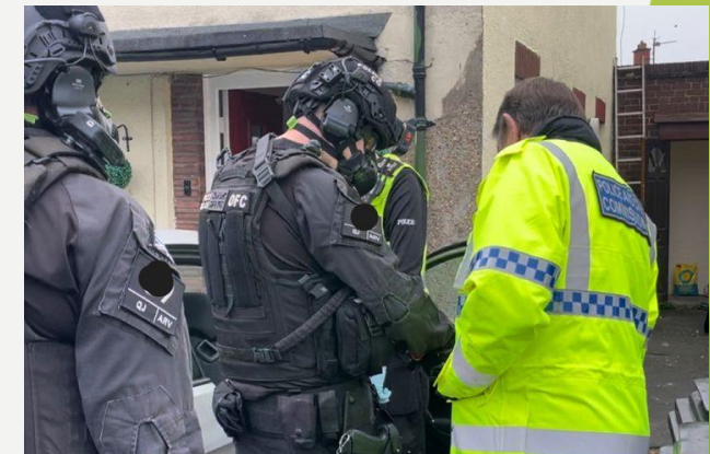
Drug warrants executed in area